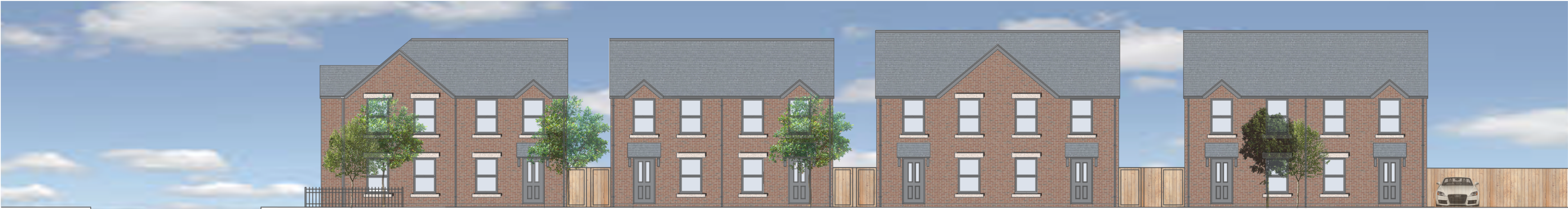
Street Scene A-A at 1:100