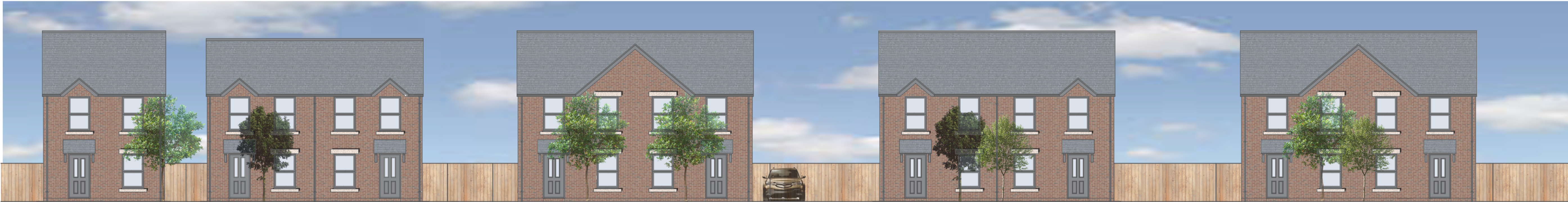
Street Scene B-B at 1:100